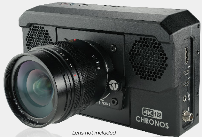
Lens not included