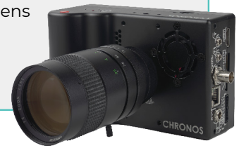
Chronos 1.4 High-Speed Camera